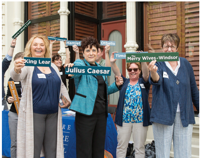
Shakespeare Day on Market Street

As you read this report, we hope you can see how the vision and mission link the diverse programs and offerings. And we thank you for helping to make this work possible.