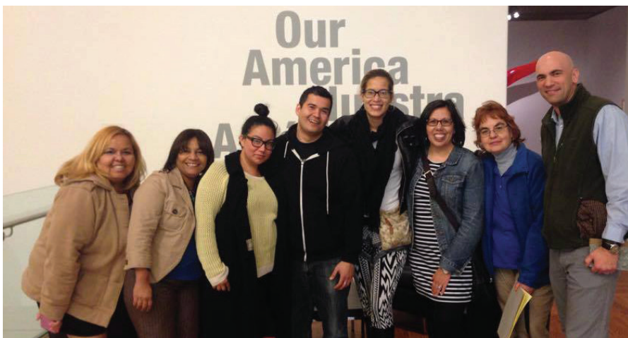
"Our America, Our Shakespeare" playwrights and workshop participants

immigrant community wrote scenes and monologues that connected their experiences arriving in Delaware to key moments in The Comedy of Errors . These writings were read at a community sharing at Delaware Art Museum on May 21, in connection with the “Our America: The Latino Presence in American Art” exhibit.