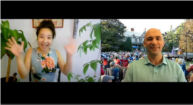
Janssen's Picnic Contest Launch Party